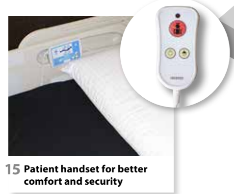
15 Patient handset for better comfort and security