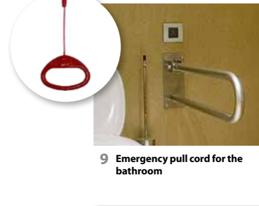
9 Emergency pull cord for the bathroom