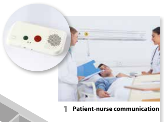
1 Patient-nurse communication