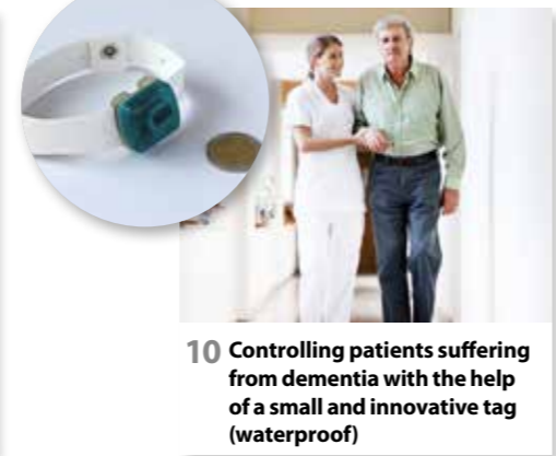
10 Controlling patients suffering from dementia with the help of a small and innovative tag (waterproof)