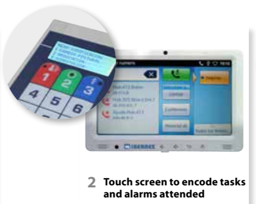
2 Touch screen to encode tasks and alarms attended