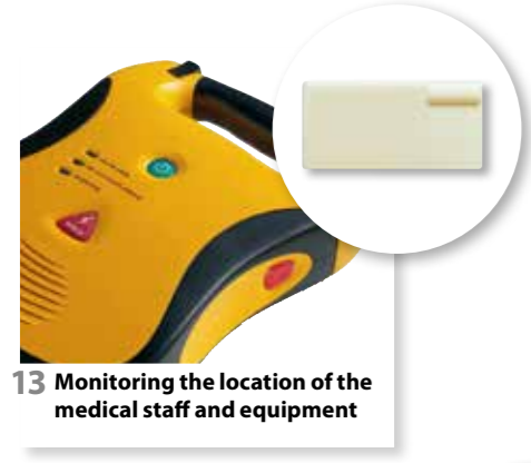
13 Monitoring the location of the medical staff and equipment