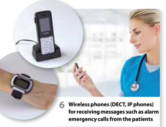
6 Wireless phones (DECT, IP phones) for receiving messages such as alarm emergency calls from the patients