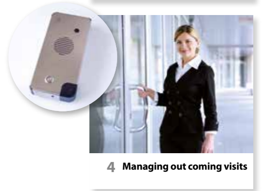
4 Managing out coming visits