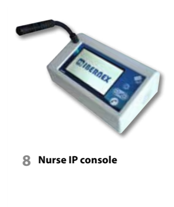
8 Nurse IP console