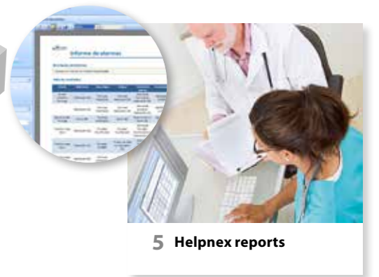
5 Helpnex reports