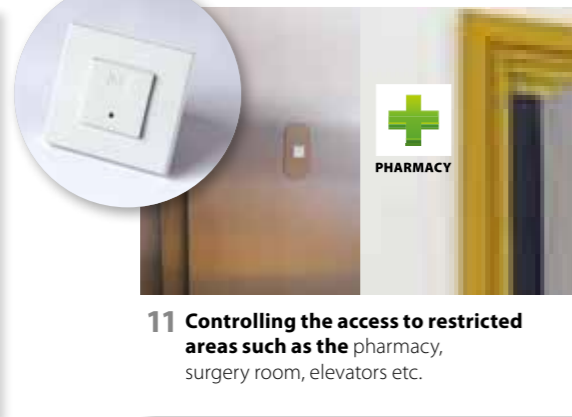
11 Controlling the access to restricted areas such as the pharmacy, surgery room, elevators etc.