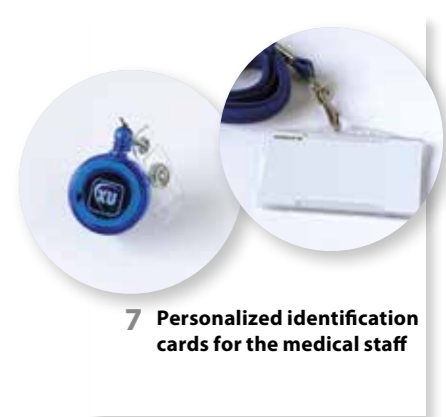
7 Personalized identification cards for the medical staff