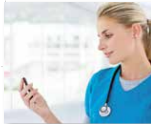
Nurse Call SYSTEM