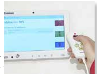
ENCODE tasks and alarms attended