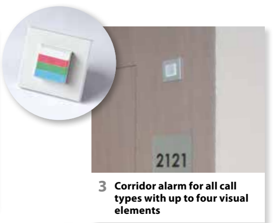
3 Corridor alarm for all call types with up to four visual elements