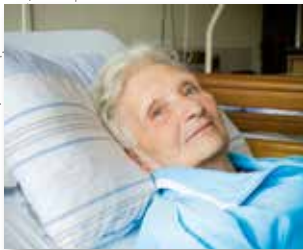
BED presence sensor