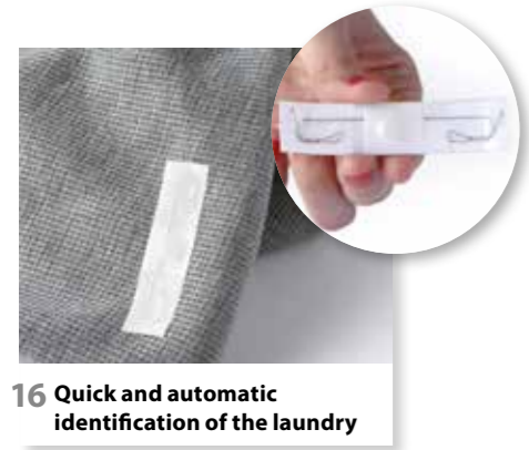
16 Quick and automatic identification of the laundry